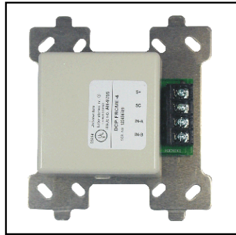
Back side of FRCME-4

The DCP-FRCME-4 shall be supplied with a plastic face plate and shall be suitable for mounting to a 4" square or double gang electrical back box. The DCP-FRCME-4 shall provide a monitor LED that is visible through the face plate.