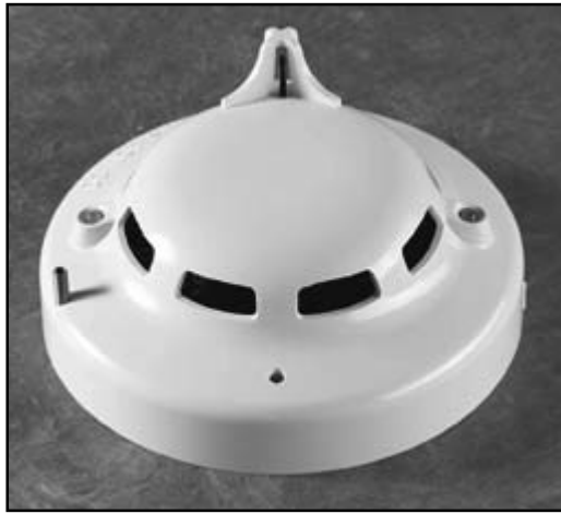
Shown without base.