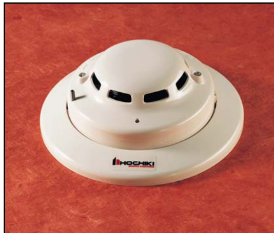
Shown with Trim Ring